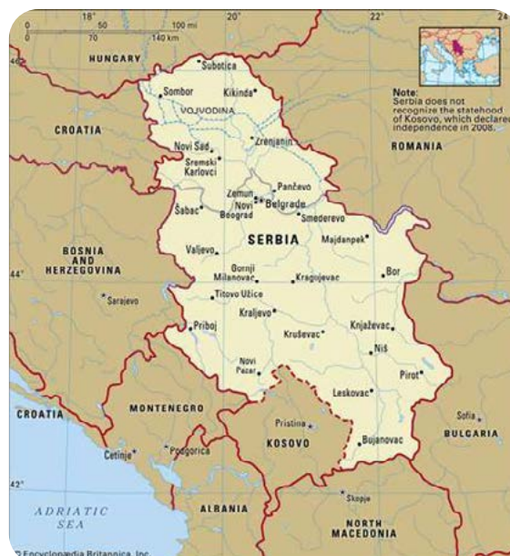
Serbia Map, Encyclopedia Britannica, Inc.