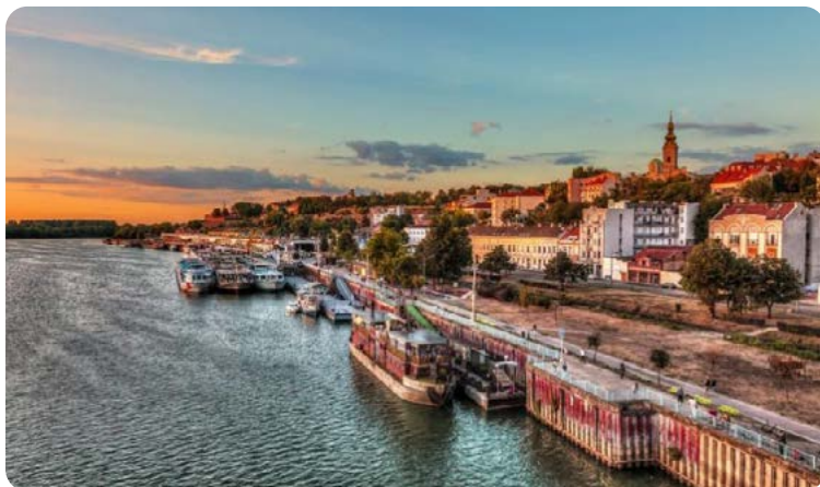
Danube River, Belgrade, Serbia

Belgrade is located at the convergence of three historically important routes of travel between Europe and the Balkans: an east-west route along the Danube River valley from Vienna to the Black Sea; another that runs westward along the valley of the Sava River toward Trieste and northern Italy; and a third running southeast along the valleys of the Morava and Vardar rivers to the Aegean Sea. To the north and west of Belgrade lies the Pannonian Basin, which includes the great grain-growing region of Vojvodina.