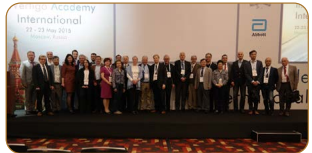
II. Vertigo Academy International 22-23 May 2015 Moscow, Russia