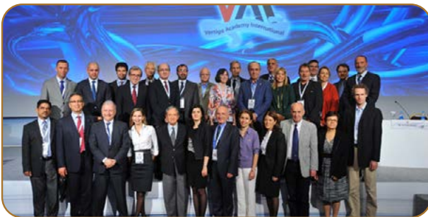
I. Vertigo Academy International 16-17 November 2013 Antalya, Turkey

Following four successive previous meetings in Turkey, Russia, India and Belarus, the V. Vertigo Academy International Meeting will be held in Belgrade.