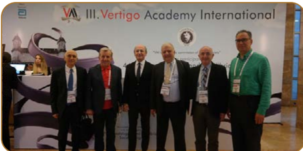
III. Vertigo Academy International 02-04 March 2017 Mumbai, India