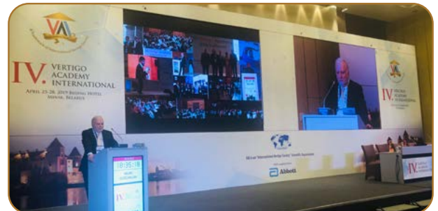
IV. Vertigo Academy International 25-28 April 2019 Minsk, Belarus